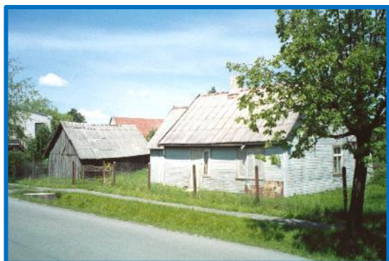
Zorach Peckel's wooden house