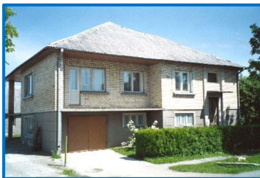
Contemporary house, where my father's wooden house stood